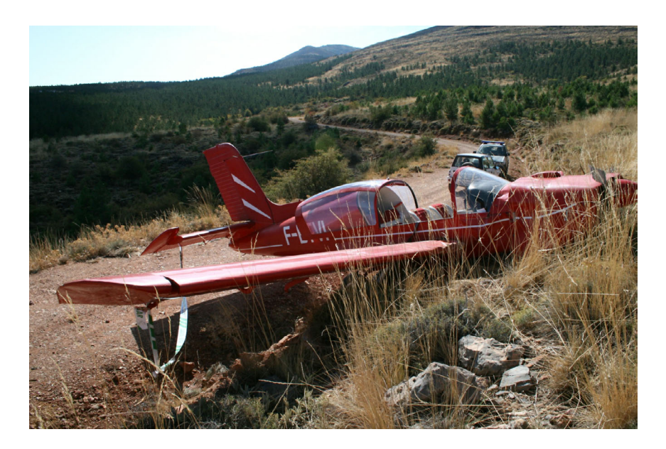
Figure 1. Condition of the aircraft after the accident

As the pilot himself stated, the cloud cover was so extensive and dense that he decided to descend and continue with the flight below the cloud layer, hoping to find less irregular terrain and clearer skies. He descended from 7,388 back to 4,000 ft. He finished the descent at 17:02:43, by which time the aircraft was in the vicinity of Padules, in the Gador Mountains. Upon noticing the increasingly elevated terrain, the pilot started gaining altitude in an attempt to clear the surrounding mountains. The impact took place at 17:07:11, with the aircraft in a climbing attitude and with full flaps so as to minimize the impact speed. The pilot notified ACC Seville of the accident 42 seconds later, relaying his exact position in subsequent communications.