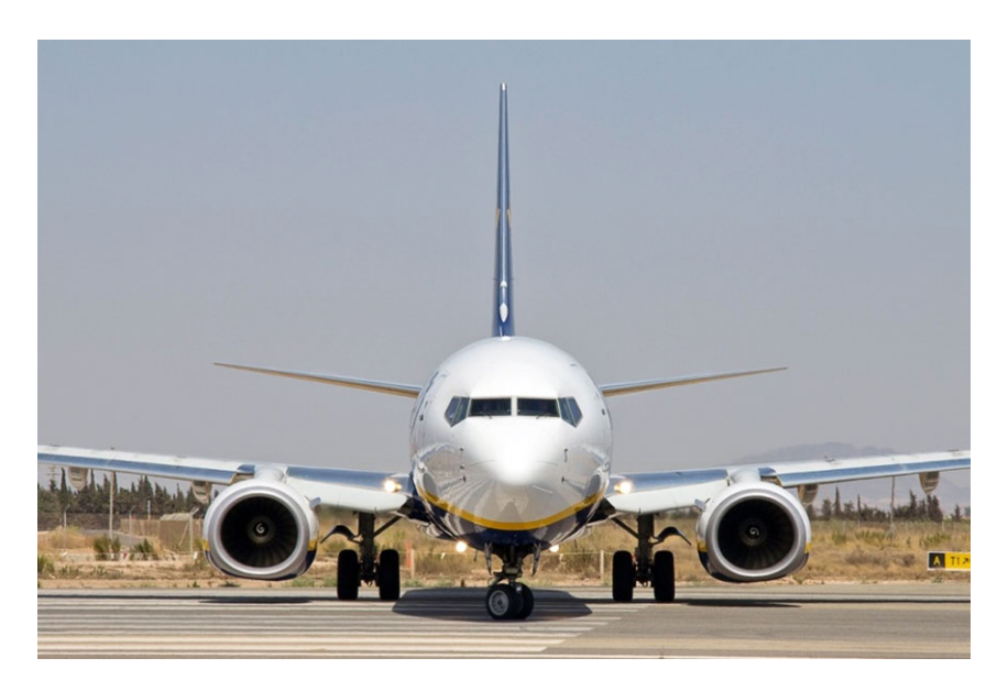
Figure 1. Photograph of the aircraft<sup>6</sup>