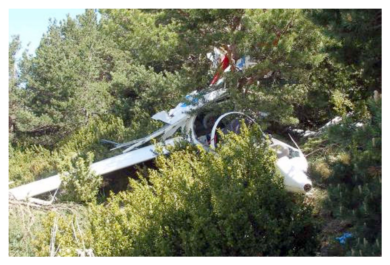
Figure 1. Photograph of the aircraft

According to the instructor, they took off runway 27. The wind was from the west at an average speed less than 5 kt on the ground and under 2 kt aloft. No lift was encountered at local first stage<sup>2</sup> drop point and aerotow continued towards second stage local drop point. After release (between the first and second stages, aprox 1,500 m) enough lift was found to continue above local ridge lines to north but not to climb to high altitude (they managed to attain a maximum altitude of 50 m above the summits in an area where the average elevation is 1,300 m). In due course a shoulder was crossed in order to turn to starboard and access some south west facing slopes. An approach line was chosen above and towards a point with a more westerly facing flank