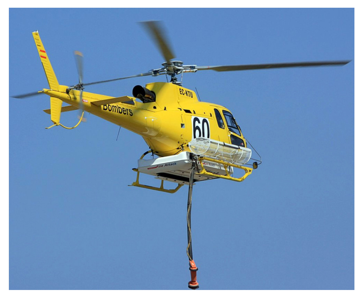
Figure 1. Helicopter with the Simplex 310 firefighting system attached

The helicopter took part in two firefighting flights, the first lasting one hour and fifteen minutes, during which the crew took on water 17 times and made an equal number of drops. Forty minutes after landing, the crew resumed operations, taking off at 16:55 to continue assisting with the firefighting efforts.