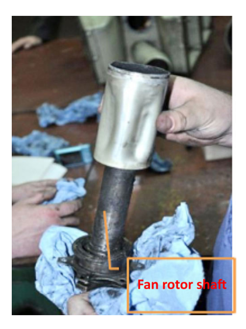
Figure 4. Dents in the outer case