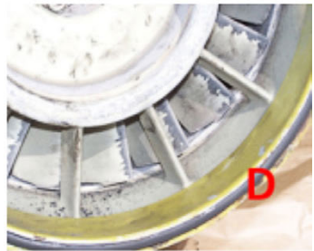
Figure 3. Close-up of the fan components