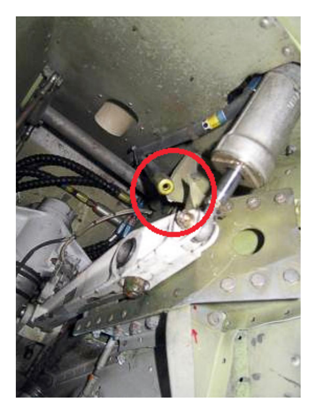
Figure 6. Return of the hydraulic line that supplies the actuator

The doors on the front wheel well exhibited damage that was consistent with being dragged on the asphalt surface.