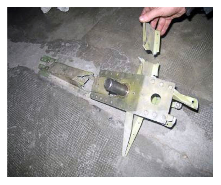
Figure 4. Beam disassembly