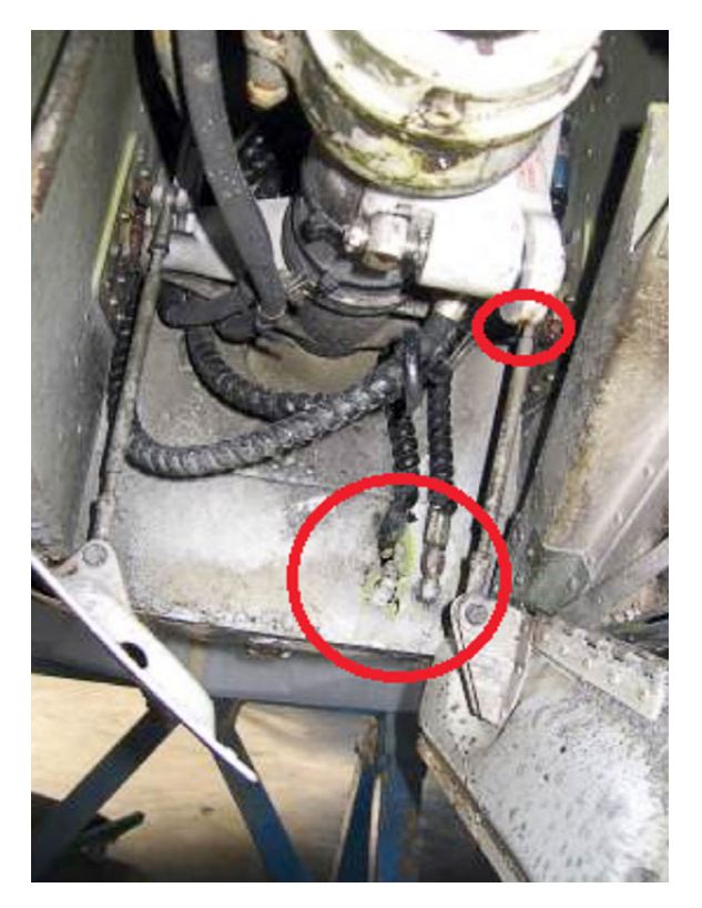
Figure 7. Impact on the rear bulkhead and part of the leg responsible for the impact

The gear position alerting system was verified to be working correctly.