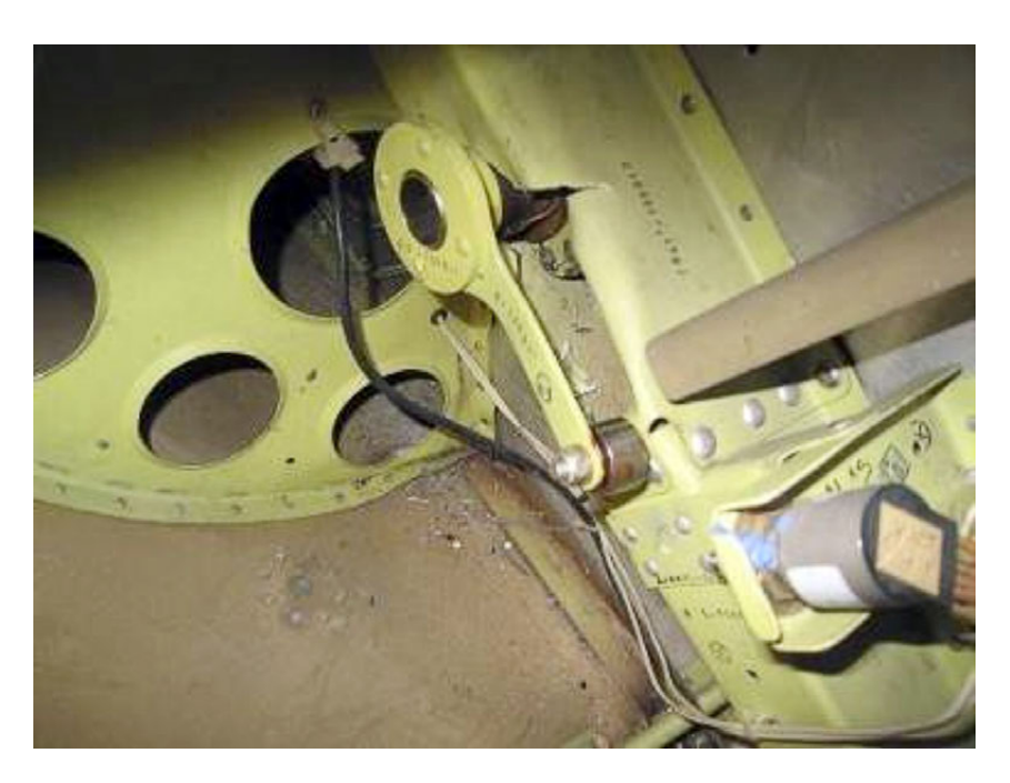
Figure 5. Cam and gear-up micro-switch

The hydraulic return line from the actuator was broken, possibly as a consequence of the movement of the actuator itself when it was dragged by the locking arm when its axle moved (Figure 6).