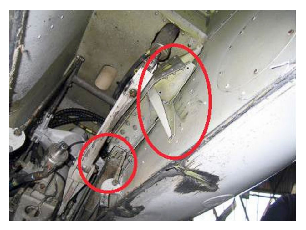
Figure 3. Forward gear wheel well showing the fracture area and the loss of the rivets that hold the drag link in place

The U-beam that houses the axle on which the nose gear's upper drag link pivots was broken near the housing where the actuating rod that moves the front left well door shifts back and forth. The part of the beam forward of this housing had lost the rivets that attach it to the side bulkhead and was loose (Figures 3 and 4).