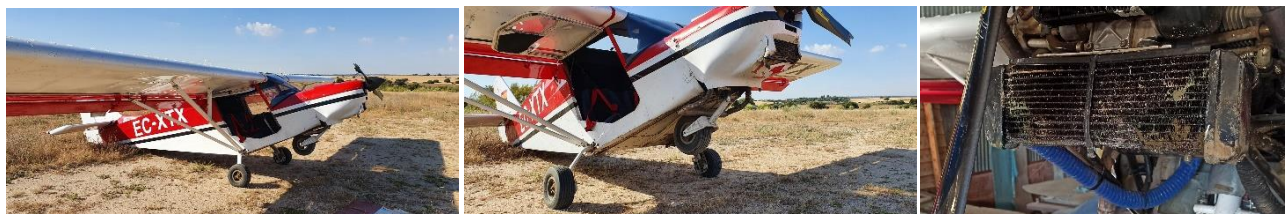
Figure 3.- General view of damage and detail of the engine coolant radiator.

Figures 3 and 4 show photographs of the damage described. No further damage was identified.