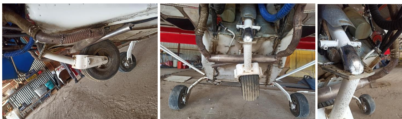
Figure 4.- Close-up of the buckled forward undercarriage

With regard to the condition of the aircraft, the control systems and components of the aircraft and engine were found to be in good condition; no components were found to be in a visible state of disrepair, nor was there any evidence that any aircraft or engine component had malfunctioned.